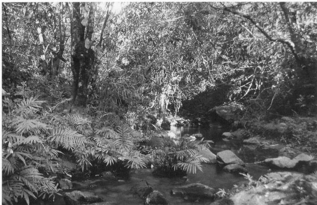
Fig. 3. General view of type locality of Parotocinclus prata . Brazil: rio São Francisco basin: tributary of ribeirão Quiricó, approximately 18°22'S 46°14.3'W.

calities, since the exclusively sand substrate at those sites is unnatural, being rather a consequence of soil erosion resulting from agriculture practices and deforestation.